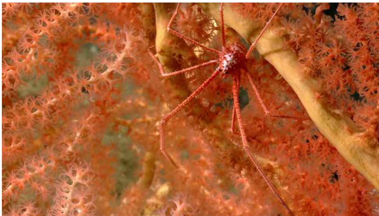
Squat Lobster on Coral in Nygren Canyon.