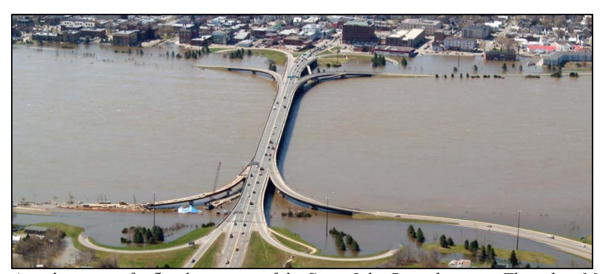
Aerial images of a flooding event of the Saint John River basin on Thursday, May 1, 2008 in Fredericton