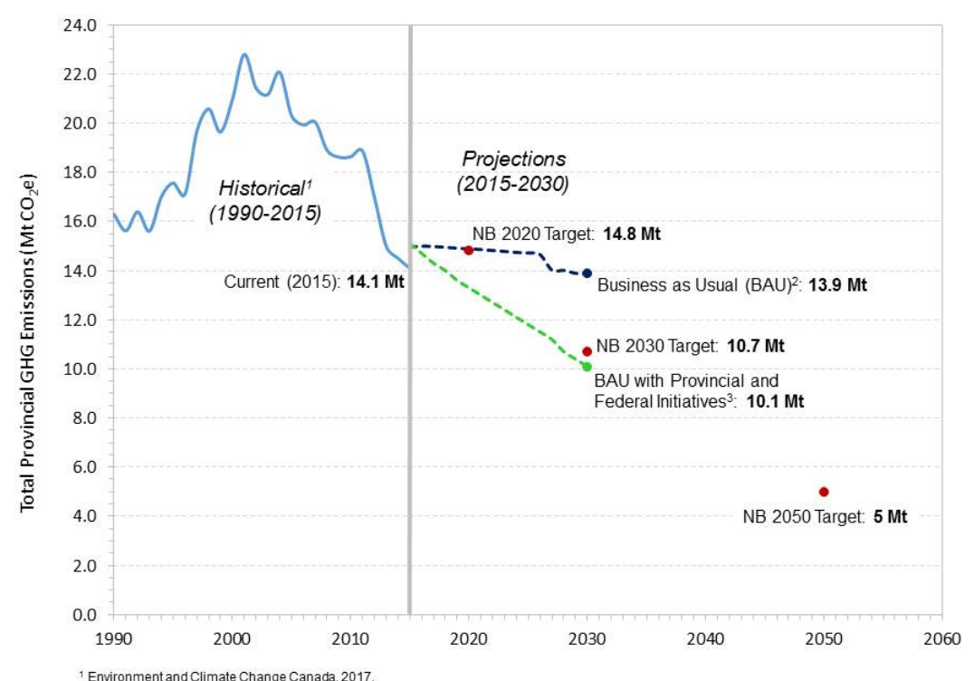
Exhibit 3.7 - New Brunswick Greenhouse Gas Emissions and Target

Environment and Climate Change Canada, 2017. Environment and Climate Change Canada, 2016. Note: Forecast will be updated to reference 2015 historical data. Climate Change Secretariat, 2016. Note: Forecast will be updated to reference 2015 historical data.