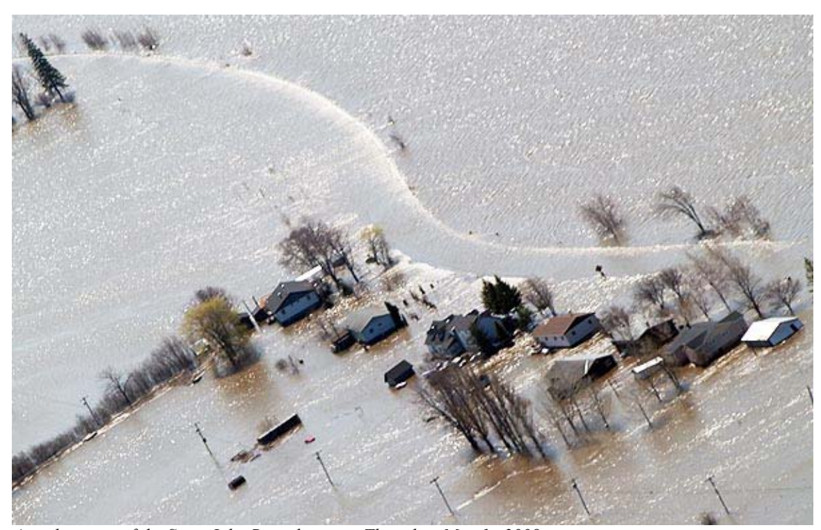
Aerial images of the Saint John River basin on Thursday, May 1, 2008.

3.141 We have concluded the Province of New Brunswick has made efforts to establish internal governance and coordination arrangements to achieve GHG emissions reduction targets and adapt to climate change. Some of the action items proposed in the new CCAP, if implemented, would result in greater coordination across government entities.