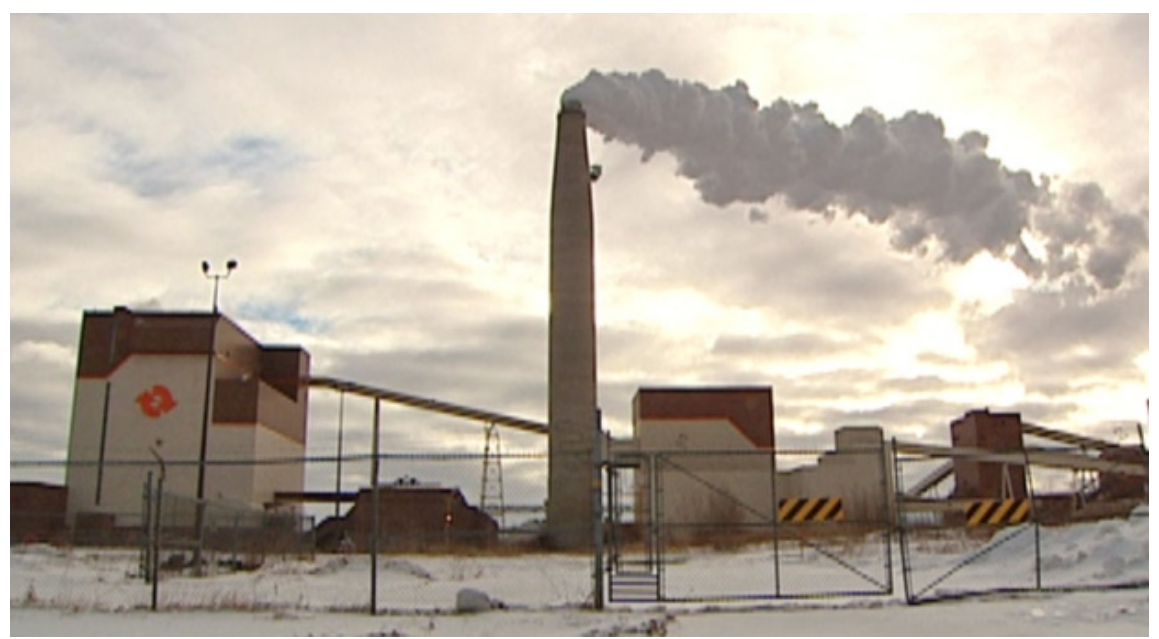
NB Power's coal-fired generating plant in Belledune is one of the province's major sources of carbon emissions.

3.51 Nova Scotia and the federal government have also reached an agreement in principle that will allow Nova Scotia to keep its coal-fired electricity plants open beyond 2030.